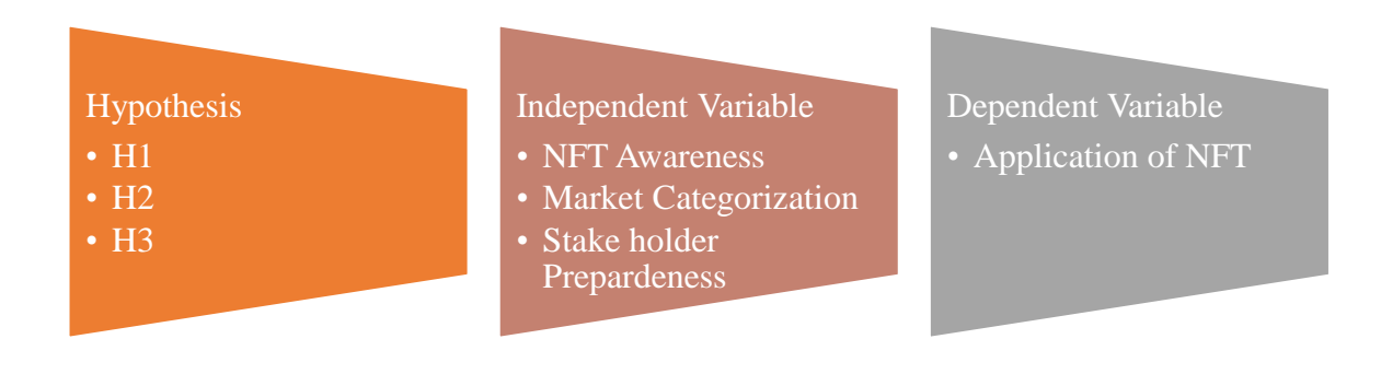
Fig 1 – Variables under the study

There is a significant impact of NFT awareness, Market categorization and stakeholder preparedness on Application of NFT in Indian Business