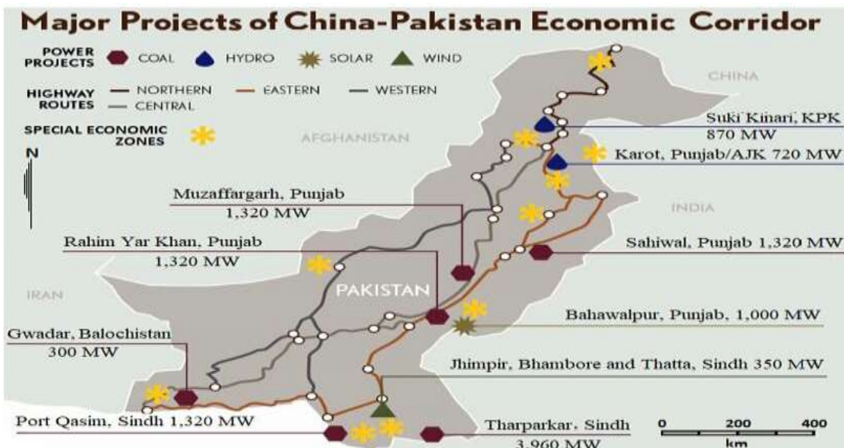
FIGURE 1: PROJECTS OF CPEC