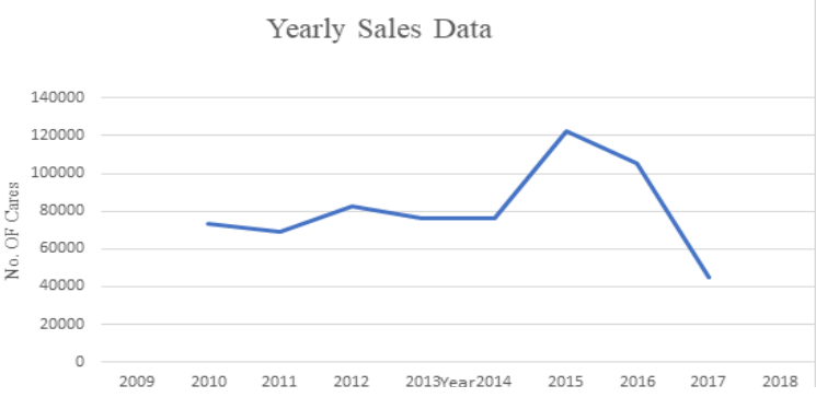
Fig.2: Suzuki Swift U.S. sales data last year