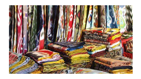
Figure 8. Silk clothes "Adras"; Silk items