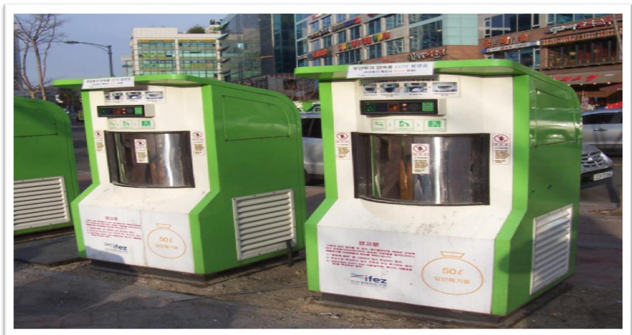
Figure 1: Songdo waste management tools to Development management

Songdo International Business District is a smart city originally built on 600 hectares of rehabilitated land along Incheon Beach, 30 km southwest of Seoul, South Korea, and connected to Incheon International Airport by a 12.3 km reinforced concrete highway bridge. Songdo is a smart city in South Korea that uses a combination of IoT and sensors to work with the waste management system. Songdo's goal is to recycle 76% of its waste by 2020 through a very good and convenient waste management system, which is connected to a truck-free waste management system. Self-contained waste bins are located in the city. Pneumatic pipes direct waste directly from the site into the underground network of pipes and tunnels, which is connected to a central waste treatment center called the "Third Zone Garbage Collection Plant." Waste is automatically sorted and recovered, buried, or incinerated for energy. Some of the reported significant benefits are greater energy efficiency and reduced landfill and energy costs (Hong et.al, 2014).