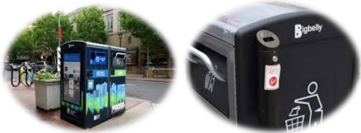
Figure 4: Bigbelly waste management tools in collaboration with the Downtown Alliance