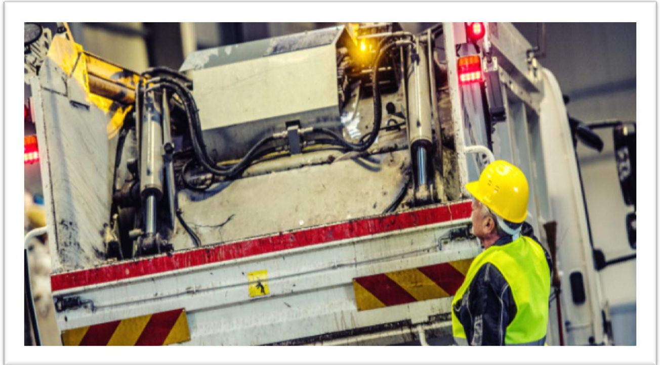
Figure 2: An image of waste management tools by ISB Global smart buckets

C) Examples of using the Internet of Things in smart cities (Case study: Polish company Bin) Divides the ability to identify and sort waste into four categories: glass, paper, plastic, and metal by integrating inputs from hardware units (sensors) into applications, the company can allow health departments to better analyze waste patterns and obtain permitted optimization paths, as well as encourage citizens to change their waste disposal habits (Giacobbe et al., 2016).