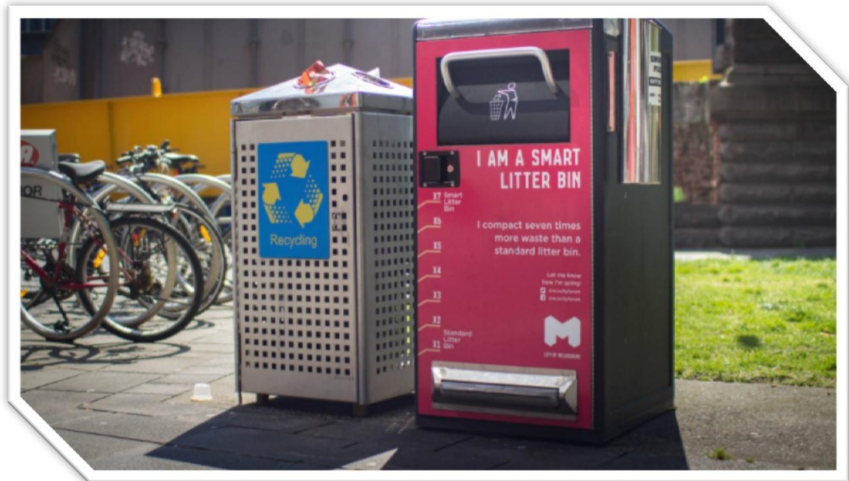
Figure 3: An image of waste management tools by Bin