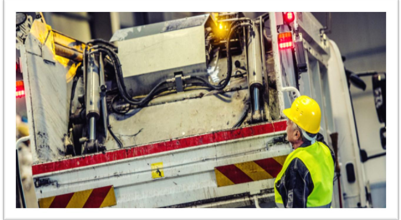
Figure 2: An image of waste management tools by ISB Global smart buckets

C) Examples of using the Internet of Things in smart cities (Case study: Polish company Bin) Divides the ability to identify and sort waste into four categories: glass, paper, plastic, and metal by integrating inputs from hardware units (sensors) into applications, the company can allow health departments to better analyze waste patterns and obtain permitted optimization paths, as well as encourage citizens to change their waste disposal habits (Giacobbe et al., 2016).