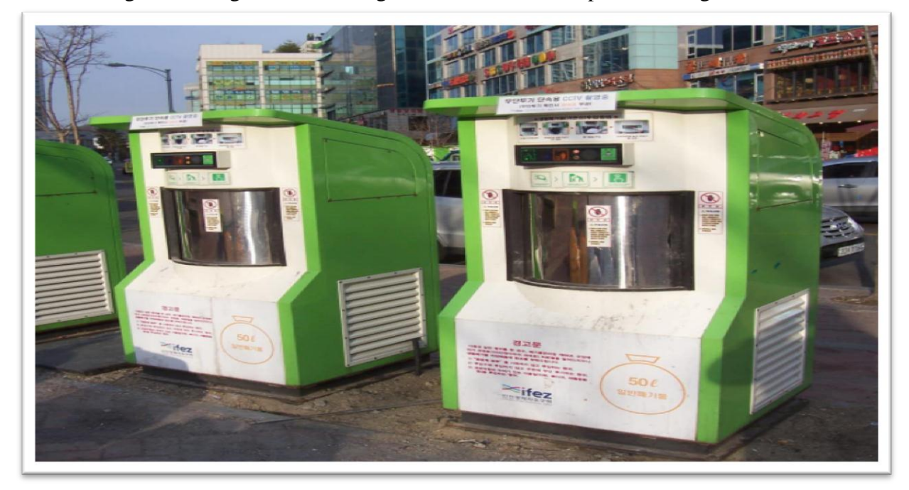
Figure 1: Songdo waste management tools to Development management

Songdo International Business District is a smart city originally built on 600 hectares of rehabilitated land along Incheon Beach, 30 km southwest of Seoul, South Korea, and connected to Incheon International Airport by a 12.3 km reinforced concrete highway bridge. Songdo is a smart city in South Korea that uses a combination of IoT and sensors to work with the waste management system. Songdo's goal is to recycle 76% of its waste by 2020 through a very good and convenient waste management system, which is connected to a truck-free waste management system. Self-contained waste bins are located in the city. Pneumatic pipes direct waste directly from the site into the underground network of pipes and tunnels, which is connected to a central waste treatment center called the "Third Zone Garbage Collection Plant." Waste is automatically sorted and recovered, buried, or incinerated for energy. Some of the reported significant benefits are greater energy efficiency and reduced landfill and energy costs (Hong et.al, 2014).