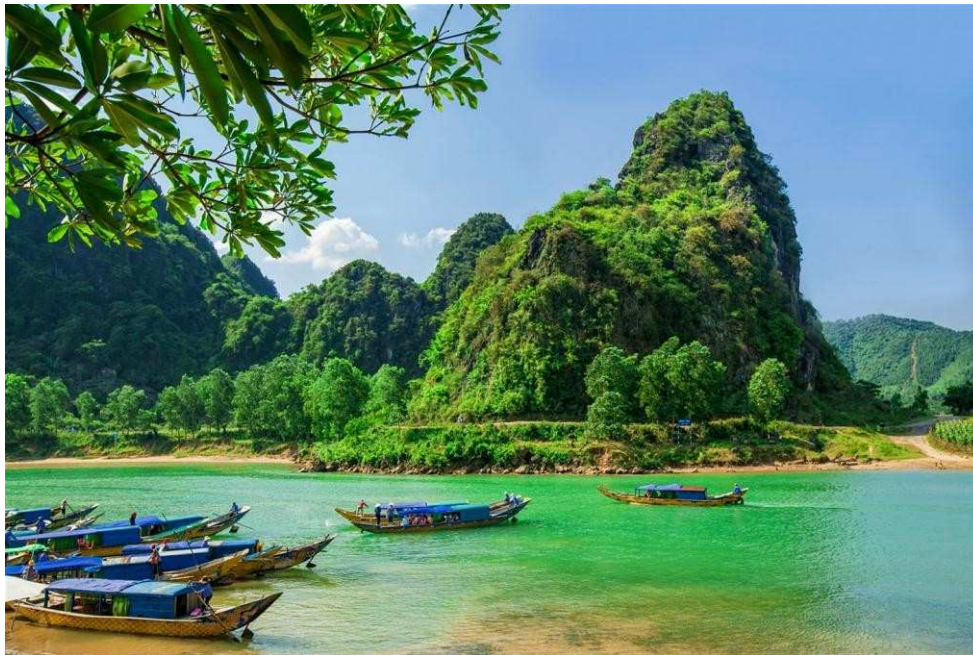
Figure 2. Phong Nha cave of Vietnam

being blessed with 125 beaches, thousands of mountains, hills and islands, nature is rich in tourist spots and cultural heritage sites. Hanoi is a fascinating city of culture, history and traditional arts. Ho Chi Minh City has many modern buildings and is the largest economic city in Vietnam. Hoi An is a thriving town that has suspended the characteristics of Chinese and Islamic exchanges and maritime trade since the days of Champa Kingdom. In particular, some tourist sites where UNESCO is registered as a World Heritage Site are one of the great attractions, such as Halong Bay, Phong Nha Ke Bang National Park, buildings of Hue and My Son ruins (Figure 2).