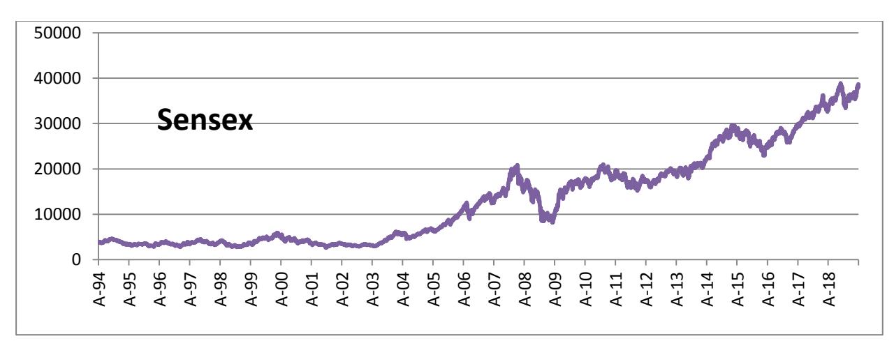
Figure 1: Graphical depiction of the chosen variables during the period of study