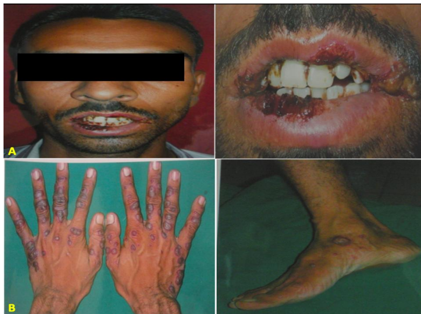
Fig.5: (A) Ulcerations and hemorrhagic crusts seen on the upper and lower lip (B) Multiple concentric target-like lesions on the upper and lower extremities.