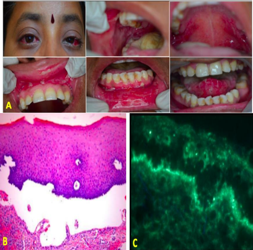
Fig.1:(A)Erythema in the sclera; Single localized ulcers seen in the upper labial mucosa in relation to 21,14 and in attached gingiva in relation to 32.Erythematous areas in the right and left buccal mucosa,right retromolar region,anterior one third of the tongue and palate. (B) Histopathology image showing parakeratinized stratified squamous epithelium with a subepithelial split and basal cell degeneration (C) DIF showed deposition of IgG and complement at the basement membrane.