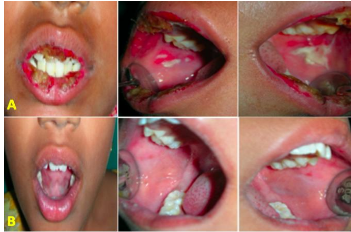
Fig.4:(A) multiple encrustations seen covering the upper and lower lips; ulcerations with surrounding erythema seen on the right and left buccal mucosa. (B) Follow up visit shows almost complete healing of the ulcers.