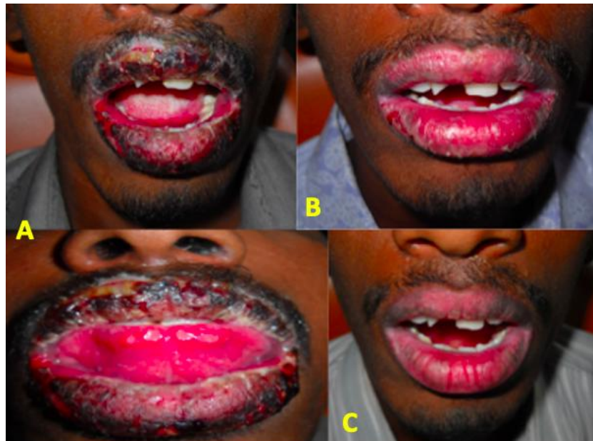
Fig.3:(A)Swelling of the upper and lower lip with multiple hemorrhagic crusting covering the entire lips which bleed on provocation. (B)and(C) Post treatment, first and second visit showed good healing of the lesion.