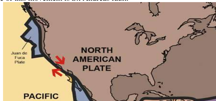
Fig.3: Transform Plate Boundary St. Andreas Fault Line.[24].

Transform boundary [23] is when 2 plates scrape past each other. This movement often causes earthquakes and fault lines. An example of this movement is S.t Andreas fault.