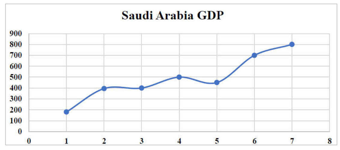
Figure 2: GDP growth of Saudi Arabia

Utilizing the FDI inbound performance and Potential index given in United nations conference on trade, researchers evaluate the nations in the region to assess their performance. According to the FDI inflow performance measure, Bahrain was the most successful country in luring FDI from 1985 to 2006, while Kuwait and Saudi Arabia had less success. The inflow performance of GCC countries were presented in Figure 3.