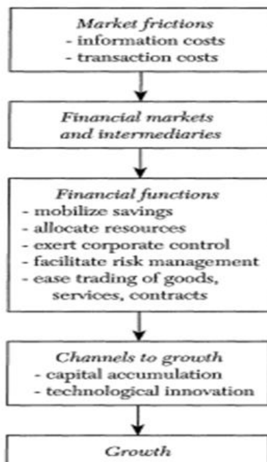
Figure (1): A Theoretical Approach to Finance and Economic Growth

By using these functions, Levine was able to statistically clarify the causal relationship between the financial sector and growth. He found that each of the five main functions contributes to capital accumulation and the technological innovation process, which directly feeds long-term economic growth. The following figure summarizes this: