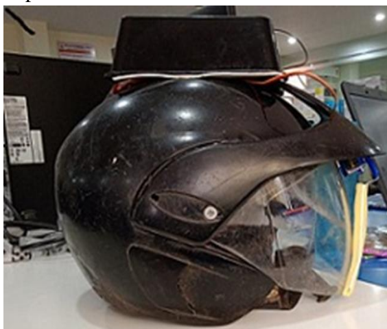
Automatic helmet wiper

Making an automatic helmet wiper, where wiper cleans the helmet visor when rain falls on the helmet. The other important components to make this automatic helmet wiper is servo motor and rain sensor.