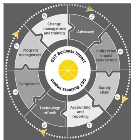
Figure 2 GST Impact (Source "[4]")

An overview of the prospects and likelihoods of GST on various sectors of the economy can be understood from the below diagram. It's high time for Indian corporations to tighten their belts, since there will surely be some teething troubles in the coming months post GST. The ball is in their court now. To embrace change gracefully, one simply needs to keep oneself in rhythm with change [15].