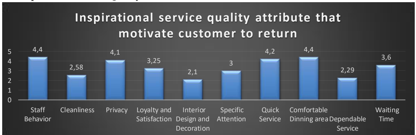
Fig.5 Inspirational Service Quality Attributes