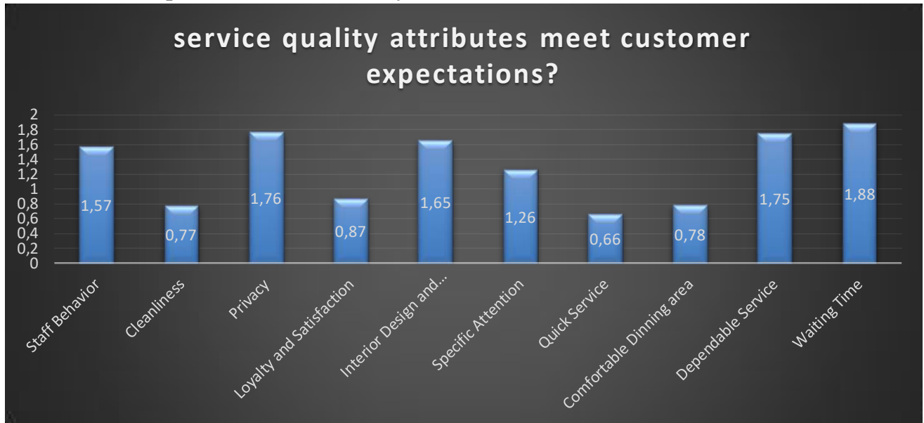
Fig.6 Customer Expectation Service Quality Attribute

In the fourth part of survey customers respond on their expectations level through yes/no. The results show that cleanliness, loyalty and quick service are those attributes that meets customer expectations. However, waiting time, privacy and dependable service are those attributes that not fully satisfy the customer.