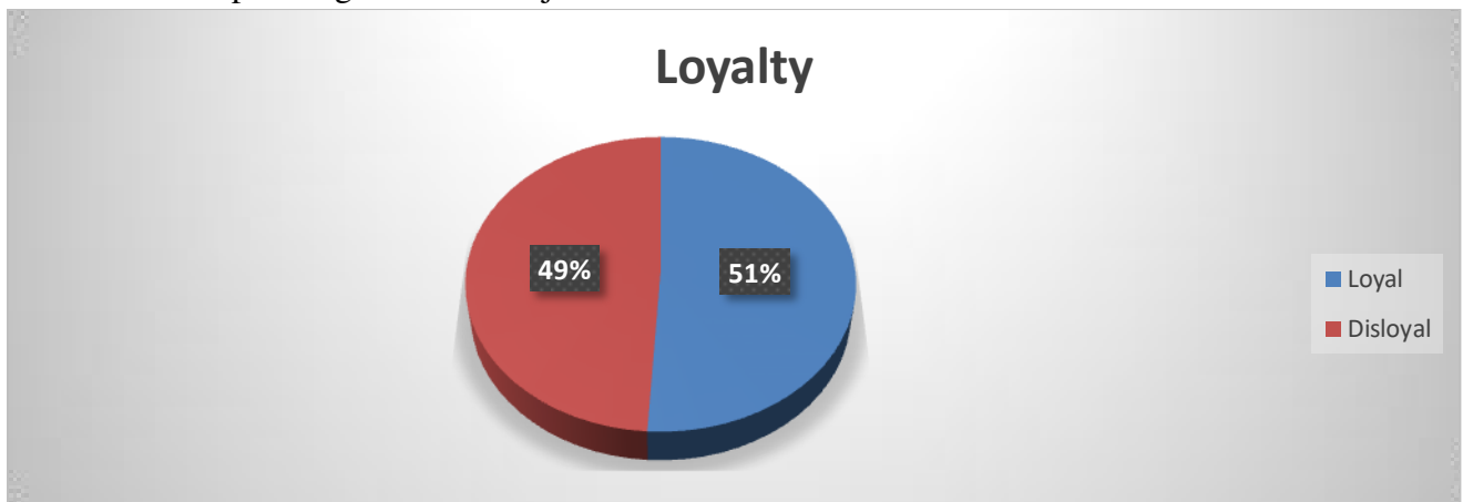
Fig.4 Loyalty of Respondents

During the survey of this data customer respond about loyalty through two Likert scale that either they are loyal to the concerned restaurant or not. Pie chart shows that 51% respondents are loyal to the concern restaurant however 49% are disloyal.