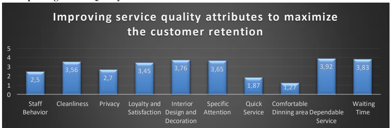
Fig.7 Improving Service Quality Attributes

The last question was asked about bring improvement in the service quality attributes. The results show that waiting time, dependable service and interior design and decoration are those attributes which needs to be improved in the restaurants. However, customers are happier with dining area and quick service.