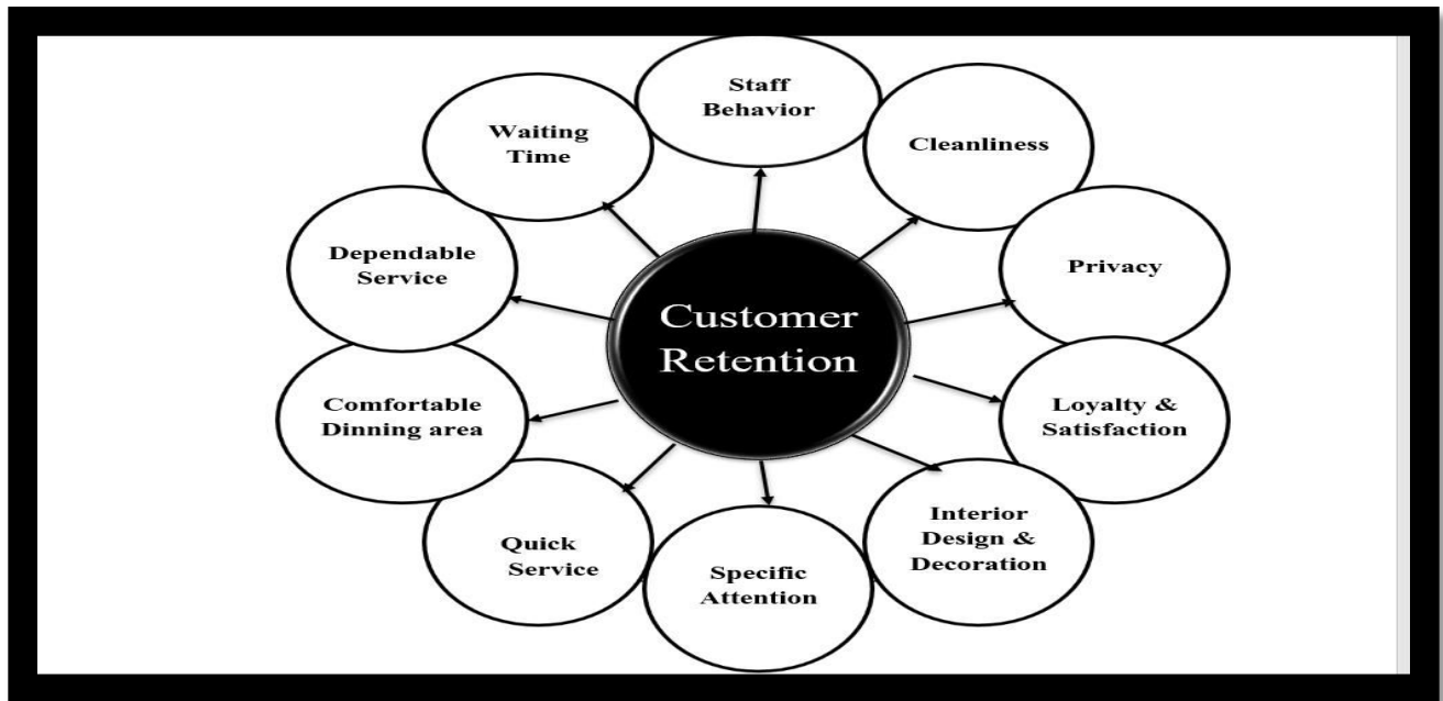
Fig.1 Service Quality Attributes impacts Customer Retention