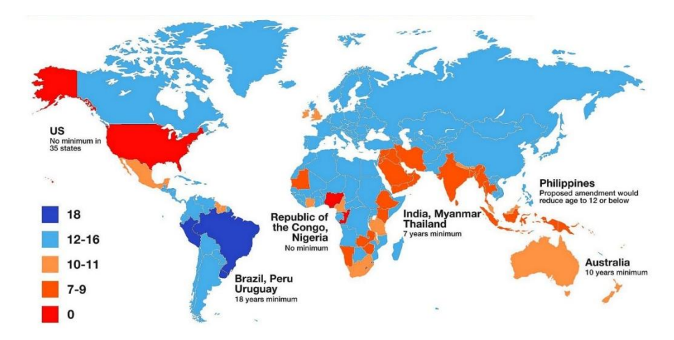
Fig.2: Minimum age of criminal responsibility around the world

The actus reus (guilty act) and mens rea (reasonableness) tests are used in common law to determine criminal liability (guilty mind). This means that a single illegal act isn't enough to bring you to justice. The prosecutor must show that the person who committed the offence was mentally capable of understanding that what he or she was doing was illegal.