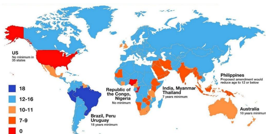
Fig.2: Minimum age of criminal responsibility around the world

The actus reus (guilty act) and mens rea (reasonableness) tests are used in common law to determine criminal liability (guilty mind). This means that a single illegal act isn't enough to bring you to justice. The prosecutor must show that the person who committed the offence was mentally capable of understanding that what he or she was doing was illegal.