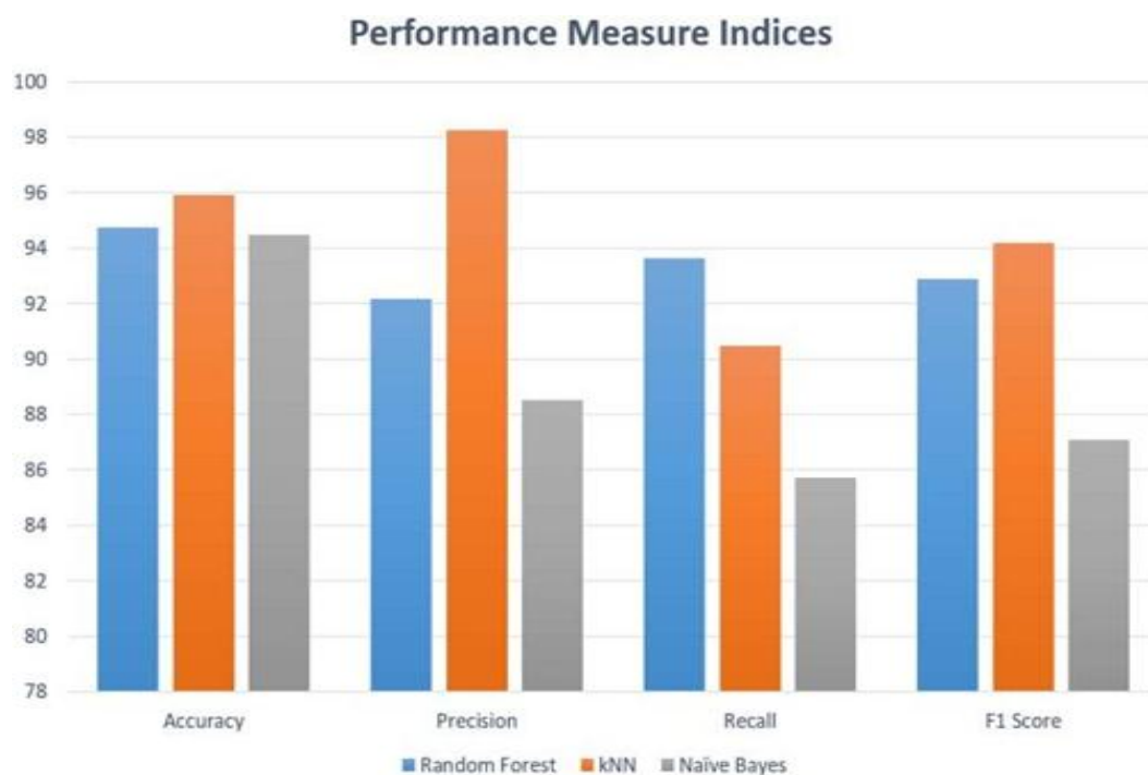
Figure 5: measures the efficiency of various algorithms