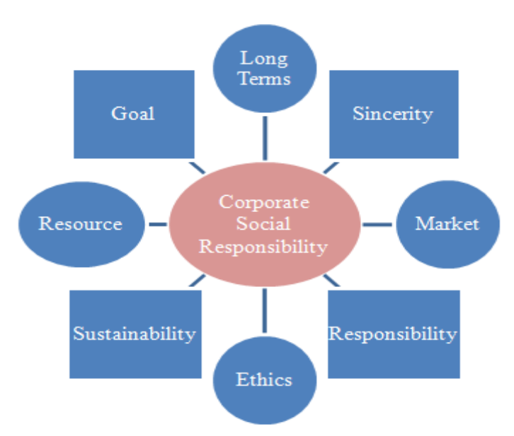
Fig.1: Different Facet of CSR

Since CSR extends the idea of employment to depart from one's particular job and organization, , it is a perfect medium for any persons to build a sense of and find meaning via employment. Clearly, in previous studies, the universal issue of across works have been discussed, especially in streams related to work revamp and job distinctiveness, optional actions and sense of work. It can be relate to this research by connecting CSR, responsiveness and meaningfulness, thus providing an overview that goes beyond the characteristics of the tasks. This review of research examines decisions that individuals make regarding their discretionary at-work actions that often affect other members of the company and their organizations [4].