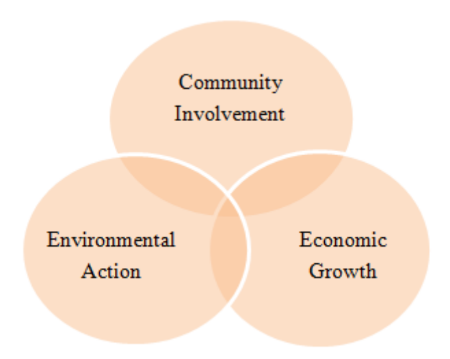
Fig. 2: Interface Connection of CSR with Different Elements

Fig.2 has been showing the connection of the CSR with different but important element of the society. A third related research stream was created through a scholarship on the importance of work. This research body only applies tangentially to JCM and the literature redesign study, contractual employee behavior and other theories and fields of human resource management (HRM) and industrial psychology. Specifically, much of the study of meaning in organizational studies has evolved from a psychological point of view in which the individual job experience prevails over social or cultural factors. While one concentrate on about CSR strengthens our sympathetic of how groups pursue meaningfulness during work, emphasis given on the human being experience of CSR, the vigorous role of the person in looking for rational action, even for the significance of intraindividual, intra-organizational, and extra-organizational levels of insight may be used in other areas of management to explore how people encounter and understand each other[8].