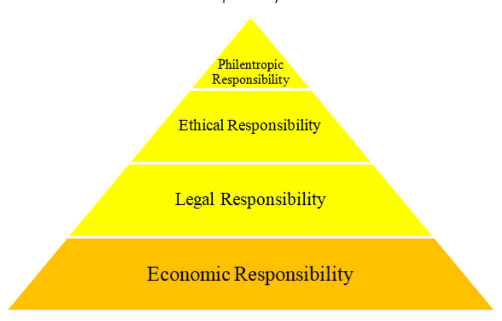
Fig. 3: Responsibility Pyramid of CSR

A model for exploring how individuals play an vigorous position in creation intelligence of CSR as a quest for finding the meaning through research has been developed. It have been highlighting three significant clarifications before the model was identified. First, it was proposed that there are several variables that make sense that could be included in each of our model's three levels (i.e., intra-individual, intra-organizational, and extra-organizational). So the variables that have been included can be used as examples, and select because of empirical confirmation to justify their incorporation and that's because they are derived from various hypotheses and research sources. While the model is in essence multilevel, it has been define that every level distinctly for effortlessness of exposure first. Variables residing at every study stage are not segregated from additional factor and rates and, as well as cross-level interaction results, have been discussed at the same level. Proposals discussing direct effects must therefore be understood in the form of a general statement that leaves all other variables making meaning constant[1][12].