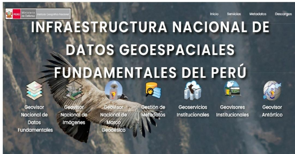
Fig.2: Geoportal of the National Geographic Institute's National Infrastructure of Fundamental Geospatial Data of Peru.

The National Geospatial Data Infrastructure is composed of the large project developed by this institution such as the National Map at a scale of 1:100,000, which are basically topographic maps composed of 500 junctions covering 100% of the national territory that can be downloaded in vector format. In addition, the official basic cartography at scale 1:25,000 of the regions of Ica, Huancavelica, La Libertad, Moquegua, Piura, Tacna and Tumbes as well as the official basic cartography at scale 1:1,000 of the cities of Puno and Huancayo can be viewed.