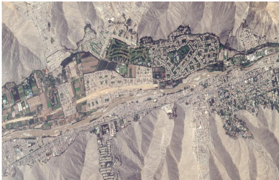
Fig.4: PeruSAT-1 image of the Chaclacayo and Lurigancho area (Lima) 2019.

Designed for a useful life of 10 years, PerúSAT-1 observes the Earth through its NAOMI camera, which has four bands (Blue, Green, Red and Near Infrared) with a resolution of 2.8 m and a panchromatic band with a resolution of 0.7 m [46]. These features make it possible to use it in applications ranging from homeland security and border monitoring, coastal surveillance and combating illegal trafficking to mining, geology, hydrology, disaster management and environmental protection. It currently allows users to map vegetation, water bodies, and urban areas with high accuracy [47].