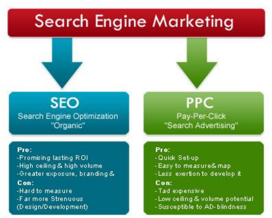
Fig. 1: Flowchart representing the Relationship between Search Engine Marketing and PPC

SEM is owed while PPC is paid for SEM. PPC is one of the quickest kinds of digital media platforms to push real traffic on the websites and the services you offer. Pay per click can be interpreted to purchasing browsers through paying search lists to support site traffic to advertisers via desktop and smartphone web search. SEM synonym include pay-per-call (pay-per-call), CPC (cost-per- click), Pay-per-clicking (pay-per-call), and CPM. There are several various SEM related synonyms and acronyms (cost-per-thousand impressions).