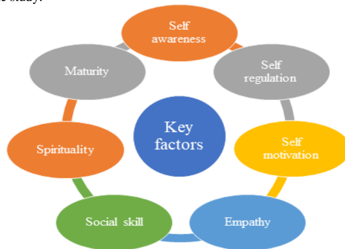
Fig.2: Key Factors to Be Considered For Setting the Questionnaire Session

The total number of the respondent has become 150 as the 100 students chosen from the 10 schools and 50 teachers have identified as the respondent from the same 10 schools. The sampling method has been selected for arranging the data collected from the respondents. Some of the keywords have been selected from the secondary research method of the previously published papers to make a framework to carry out the survey. These selected keywords are Self-awareness, self-regulation, self-motivation, empathy, social skill, spirituality, maturity. Further analysis of the data has been done through regression analysis. Figure 2 has been showing the key factors related to the study.